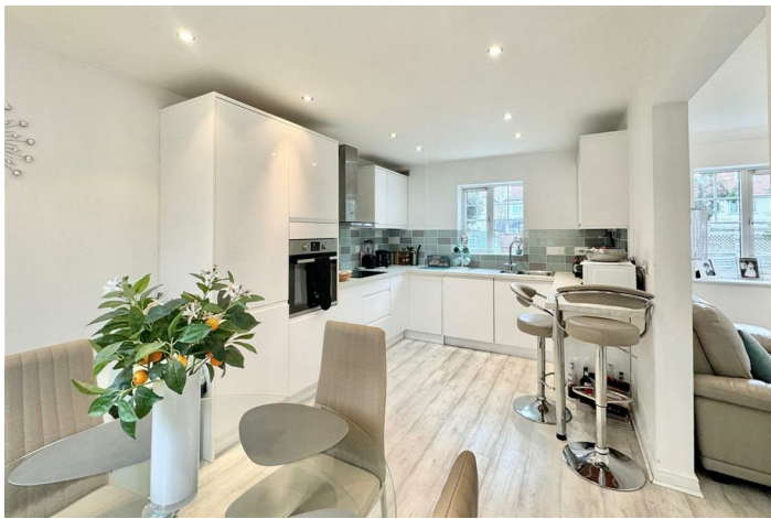
House - Detached (EPC Rating: C)

TITHE CLOSE, LONDON, NW7 2QD Offers Over £650,000